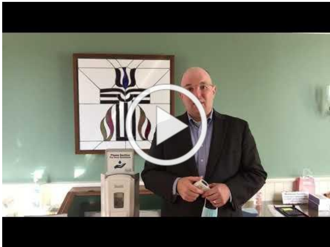
Weekly Word October 2